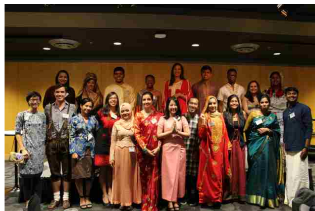
Fulbright-Nehru Doctoral Research fellows at a Gateway Orientation in University of Idaho, Moscow, ID

only: Agricultural Sciences; Bioengineering; Computer Science (with emphasis on cyber security and digital economy); Economics; Education Policy and Planning; Energy Studies; International Law;