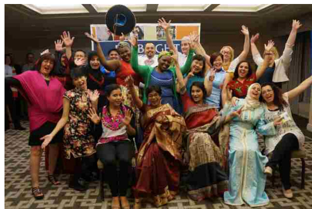
Fulbright Distinguished Awards in Teaching fellows with international Fulbrighters at an orientation program in Washington, D.C.

The Fulbright Distinguished Awards in Teaching Program is designed to recognize and encourage excellence in teaching in the U.S. and abroad. The