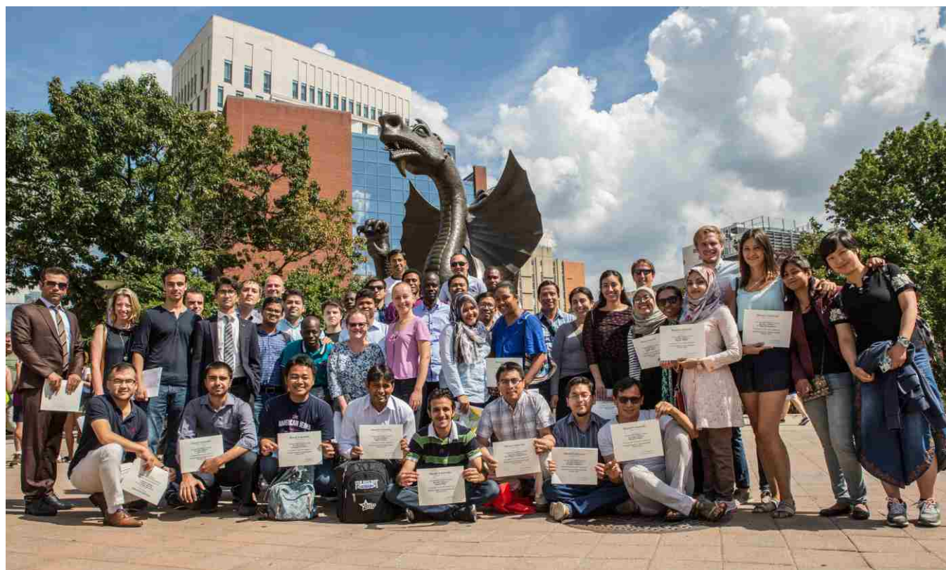
Fulbright-Nehru Doctoral Research fellows with Fulbrighters from other countries during a pre-academic program at Drexel University, Philadelphia, PA

International Security and Strategic Studies; Materials Science (with emphasis on environmental applications); Neurosciences; Public Policy; Public Health; Study of India (limited to anthropology, history, sociology, and visual and performing arts); Study of the U.S. (limited to anthropology, history, sociology, and visual and performing arts); Urban and Regional Planning (with emphasis on smart cities and waste management); and Women's and Gender Studies.