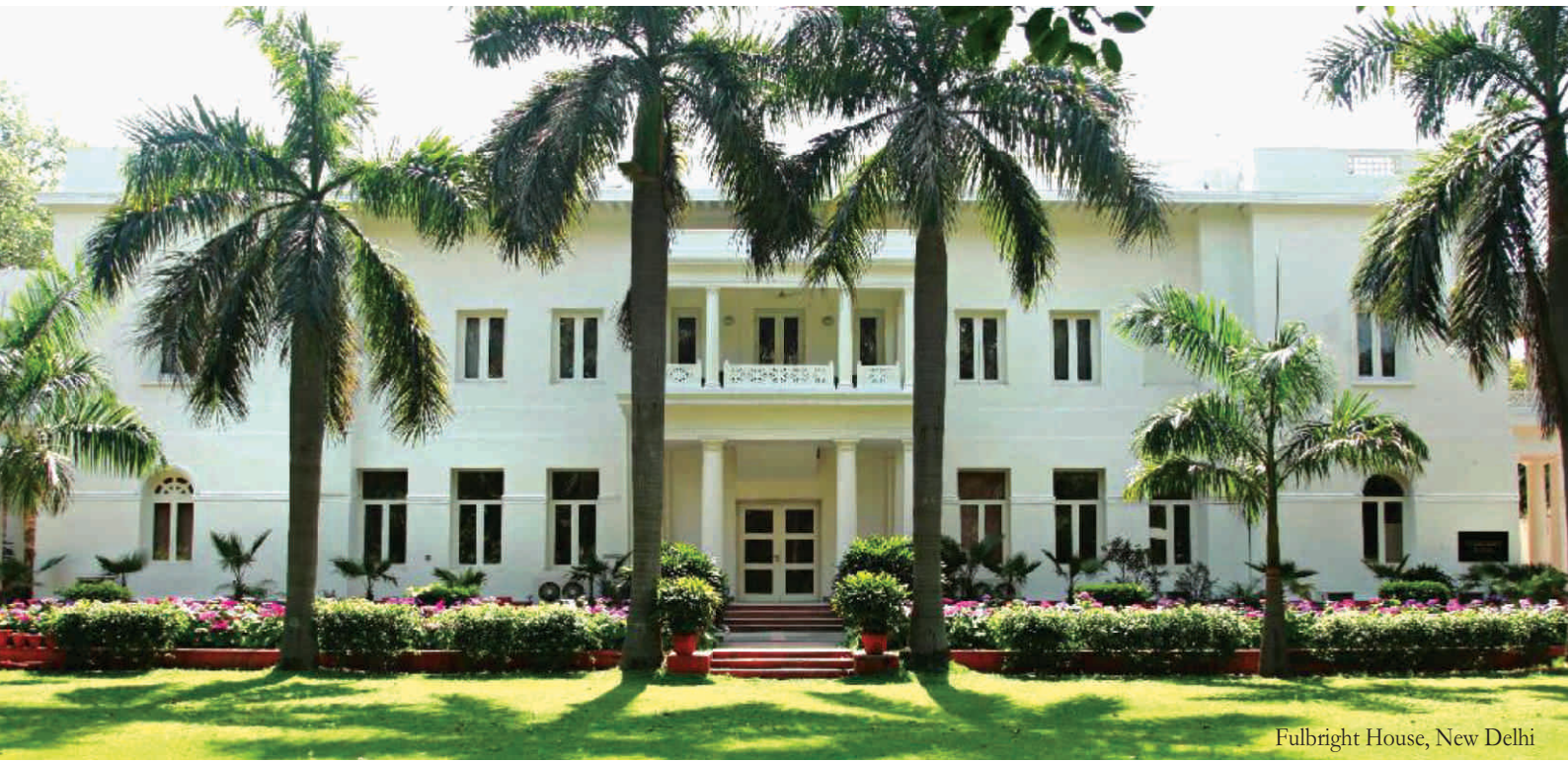
Fulbright House, New Delhi

FELLOWSHIPS FOR INDIAN CITIZENS 2018-2019